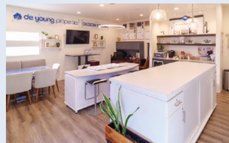
An Exclusive and Valuable Resource

Why settle for someone else's idea of home? With De Young, your dream home is designed around you.