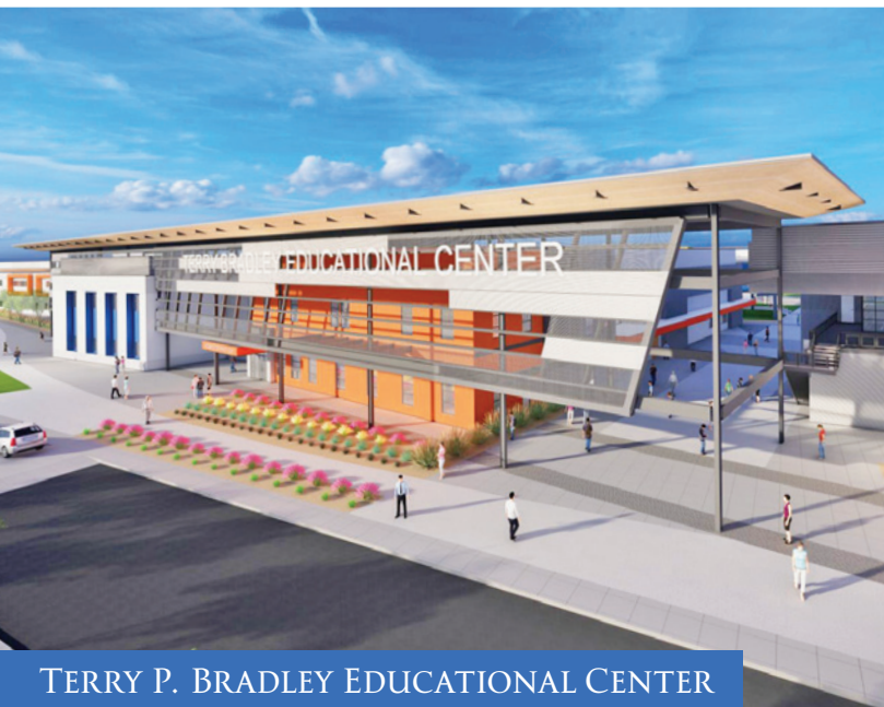
TERRY P. BRADLEY EDUCATIONAL CENTER