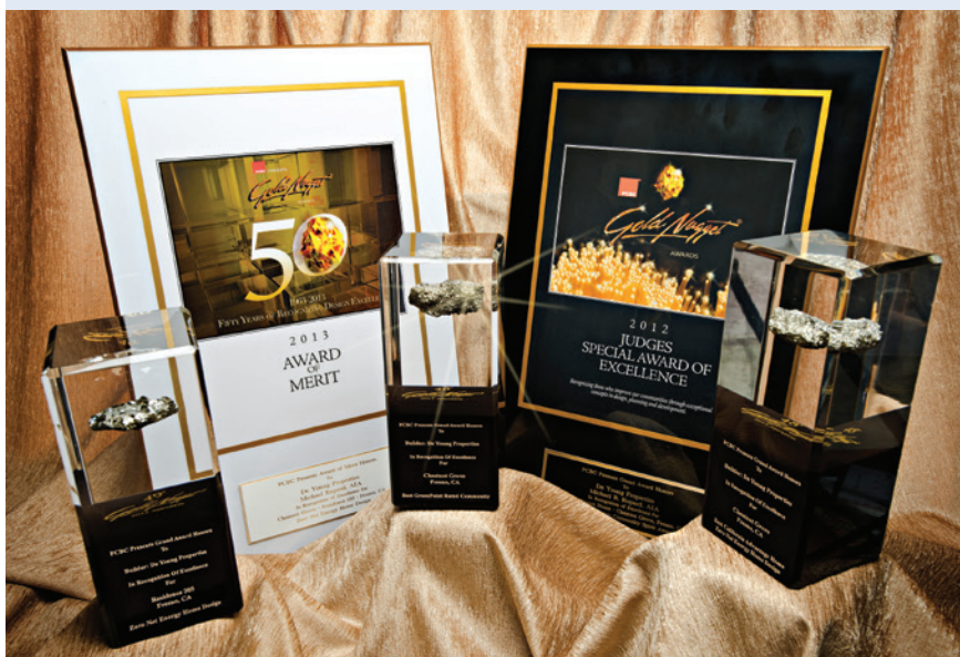
Pacific Coast Builders Conference Gold Nugget Awards