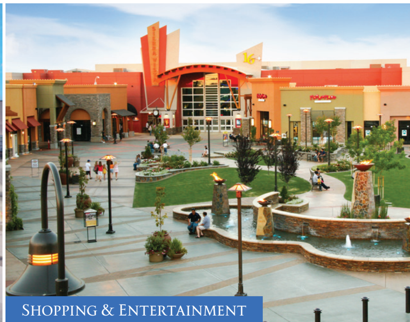
SHOPPING & ENTERTAINMENT