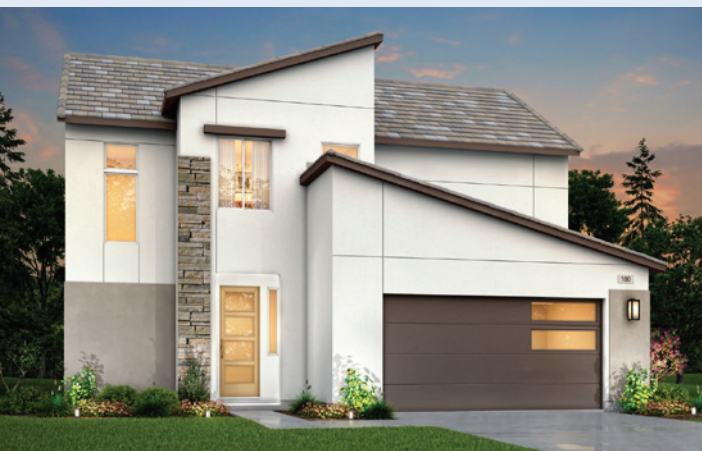
2026 St. Jude Dream Home – Discover 180 • Contempo

Whether raising funds for children, building a home for a local hero or supporting local schools, non-profits and community groups, De Young builds dreams and gives hope to our community.