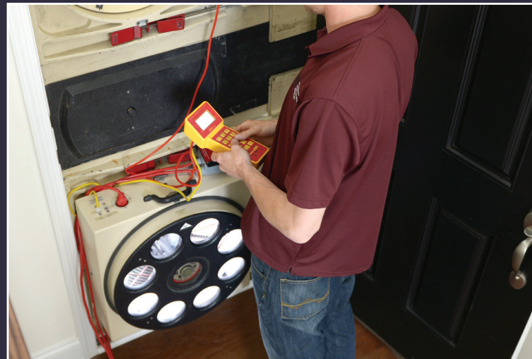
A Blower Door Test is performed on every Schell Brothers Home to obtain your home's HERS score.

HERS SCALE The Home Energy Rating System (HERS) measures a home's energy efficiency.