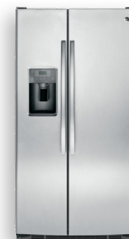
GE® SIDE-BY-SIDE REFRIGERATOR

Want a GE Profile, Café, or Monogram appliance suite instead? We have plenty of selections to choose from during your Design Day.