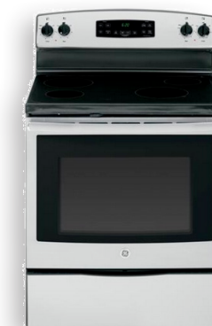
GE® ELECTRIC RANGE