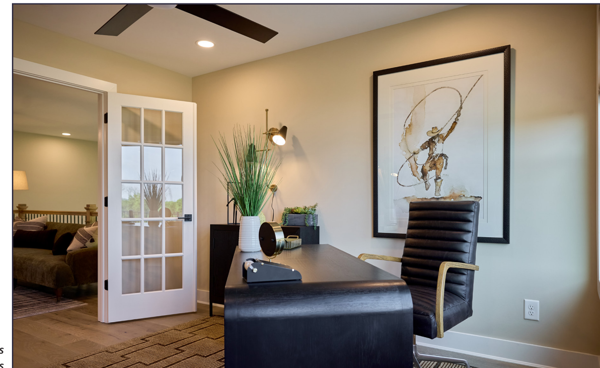
Please note: photos include optional selections

Because no one should have to hunt for a charger, we include USB-C and USB-A combo outlets in key kitchen locations. Your devices stay charged, and your counters stay clutter-free.